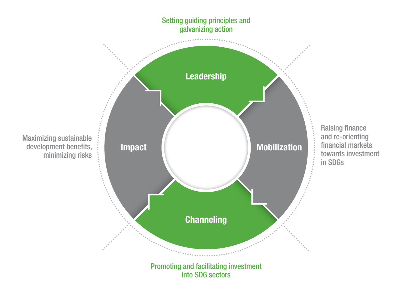
Figure 3. Strategic framework for corporate investment in the SDGs