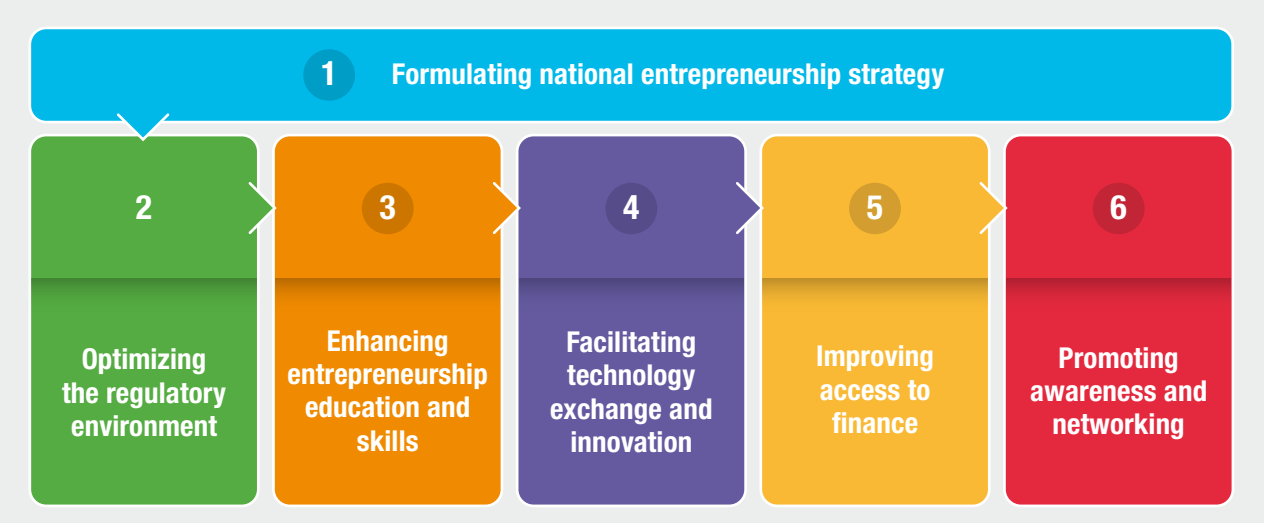
Box figure 1. Key components of UNCTAD's Entrepreneurship Policy Framework

The EPF further proposes checklists and numerous references in the form of good practices and case studies. The case studies are intended to equip policymakers with implementable options to create the most conducive and supportive environment for entrepreneurs. The EPF includes a user guide, a step-by-step approach to developing entrepreneurship policy, and contains a set of